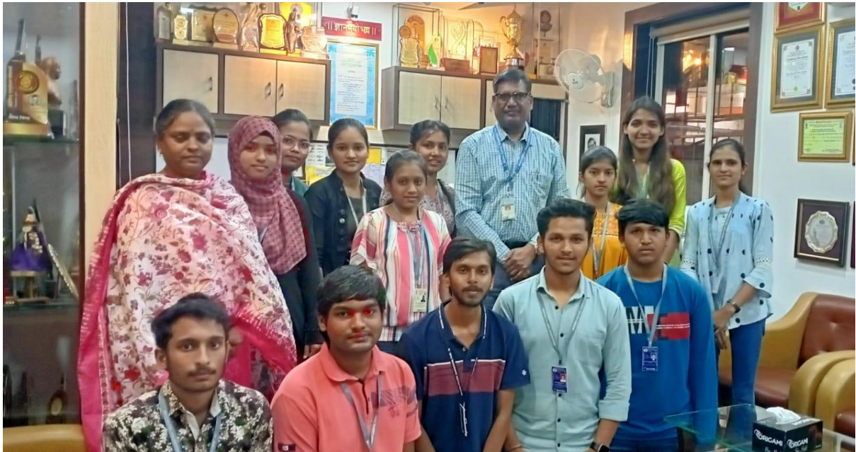
Beneficiary students of Seva sahyog scholarship